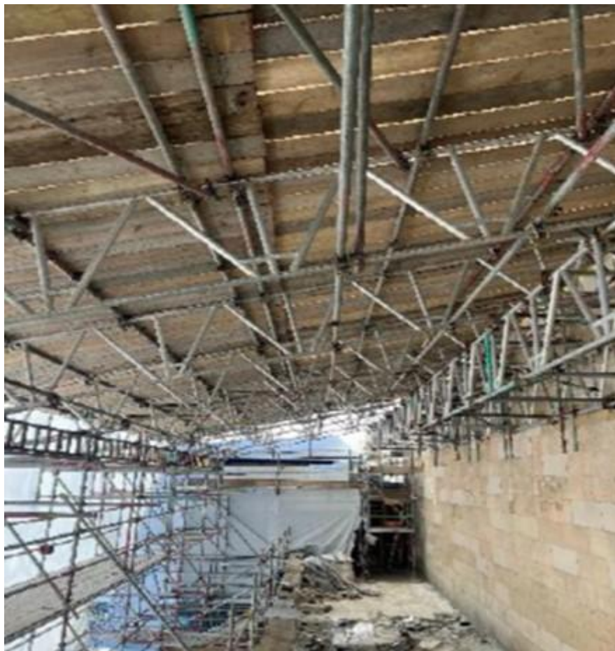
Figure 6 ROOF 4A (OVERLOOKING ARGYLE ST.) TEMPORARY ROOF SCAFFOLD INSITU. EXISTING MEMBRANE ON ROOF 4A BEING REMOVED.