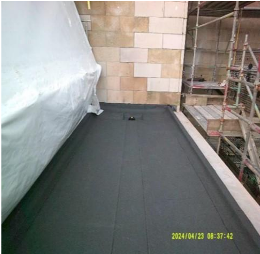
Figure 5 ROOF AREA 3A: THE NEW ROOF MEMBRANE PARTIALLY LAID. THE EDGE DETAIL IS WORK IN PROGRESS TO IMPROVE THE DISCHARGE OF RAINWATER.