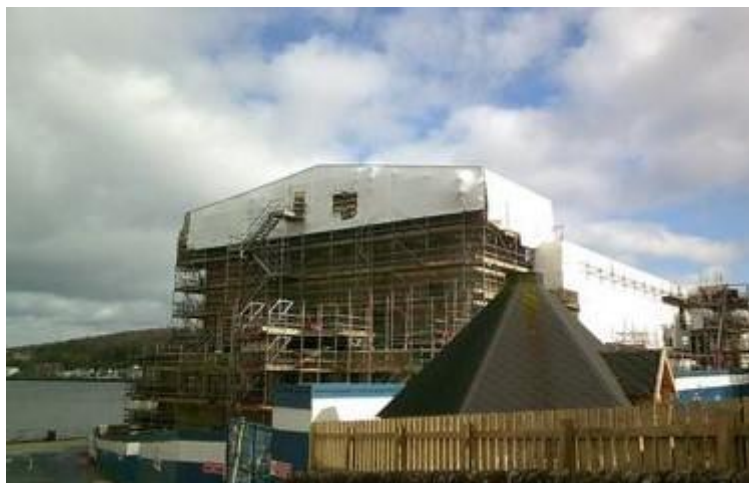
Figure 2 ROOF 3 (FLYTOWER ROOF) TEMPORARY ROOF COVERING VIEWED FROM MACKINLAY STREET.