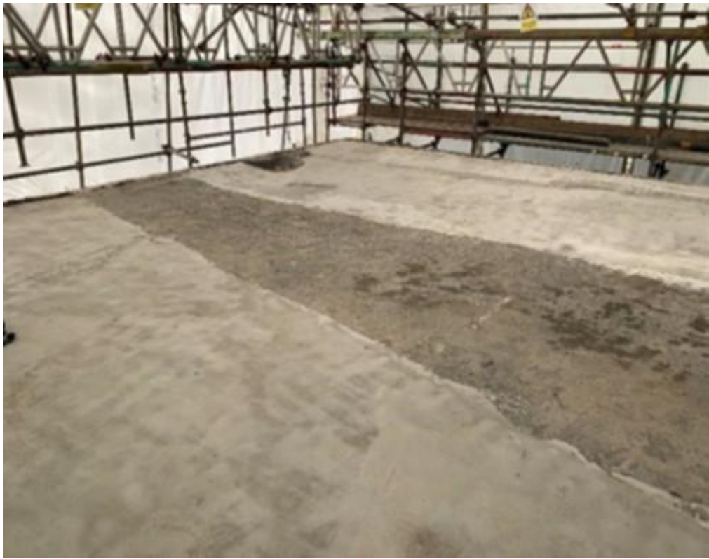
Figure 3 ROOF 3 FLYTOWER: LEVELLING SCREED POURED IN REPAIR AREAS PRIOR TO INSTALLATION OF VAPOUR CONTROL LAYER (VCL).